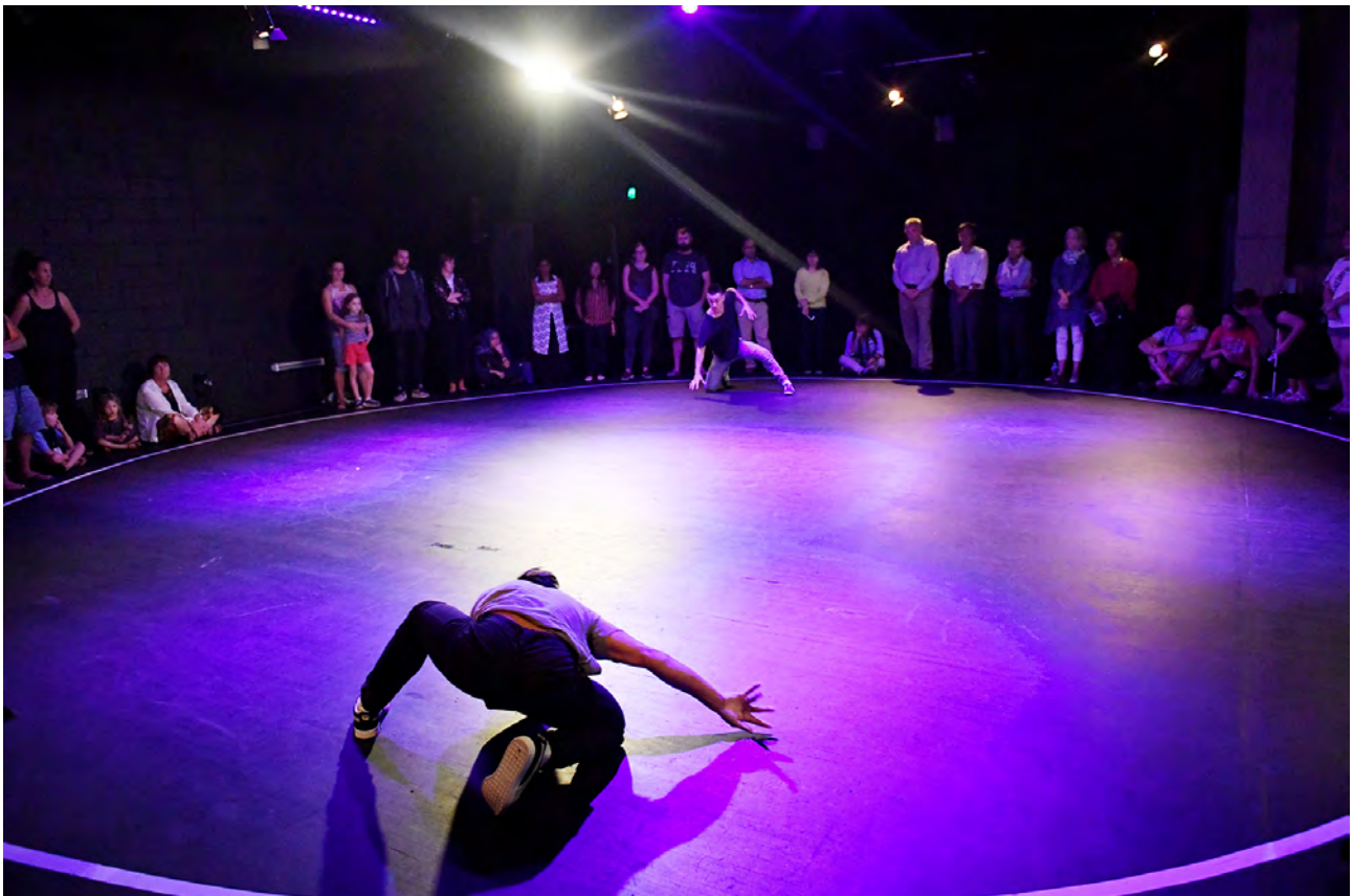
Season at Darwin Festival.