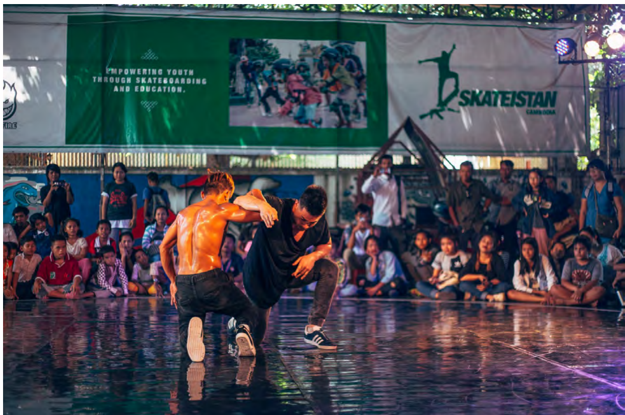
Season at Skateistan, Phnom Penh.